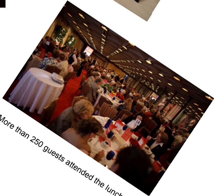
More than 250 guests attended the luncheon